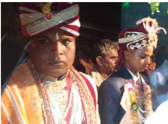
Grooms arriving at the wedding