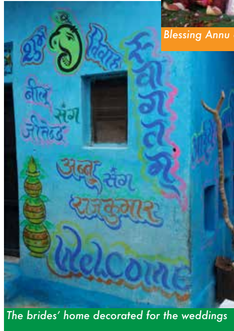
The brides' home decorated for the weddings