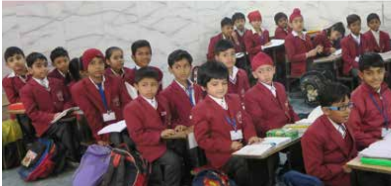
Classroom of students at Guru Angad Public School in Delhi

VARANASI & DELHI: The group met with principals and teachers, all of