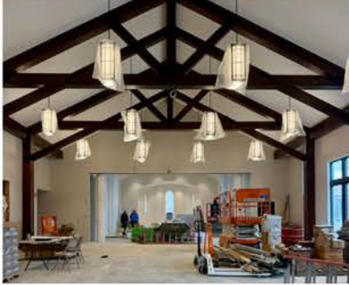
Images: Metropolis Center, Chapel Dome, Sanctuary, Social Hall