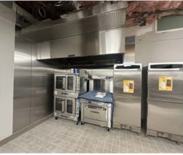
Images: Prayer Garden Walkway, Office, Kitchen