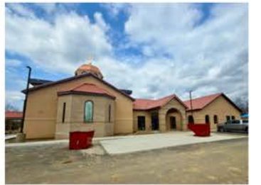
Image: Bell Tower