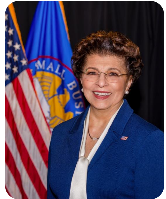
Administrator Jovita Carranza

Upon a request received from a state's or territory's Governor, SBA will issue under its own authority, as provide by the Coronavirus Preparedness and Response Supplement Appropriations Act that was recently signed by the President, an Economic Injury Disaster Loan declaration.