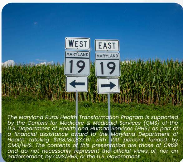
The Maryland Rural Health Transformation Program is supported by the Centers for Medicare & Medicaid Services (CMS) of the U.S. Department of Health and Human Services (HHS) as part of a financial assistance award to the Maryland Department of Health totaling $168,180,837.61 with 100 percent funded by CMS/HHS. The contents of this presentation are those of CRISP and do not necessarily represent the official views of, nor an endorsement, by CMS/HHS, or the U.S. Government.

Launching mid-June, CRISP is establishing the Rural Provider Connectivity and Optimization Program. The aim of the program is to increase adoption of HIE services across Rural MD by providing funding to offset the cost of building EHR interfaces to exchange data with CRISP. HIPAA-covered providers located in rural MD may be eligible for funding under this program. Interested individuals and organizations can join our mailing list to stay informed of all program announcements.