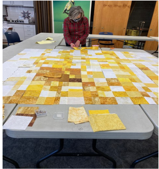
4. Sarah tweaking the fabric layout