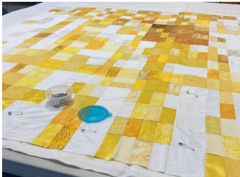
5. The completed top ready to finish

The final product will be displayed on the wall behind the choir on Easter Sunday.