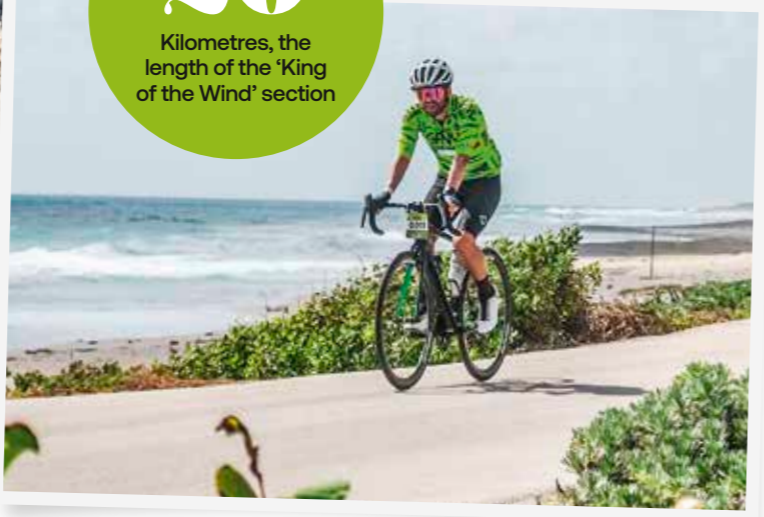
Top The eastern shore offers an unbroken stretch of white sands

20 Kilometres, the length of the 'King of the Wind' section