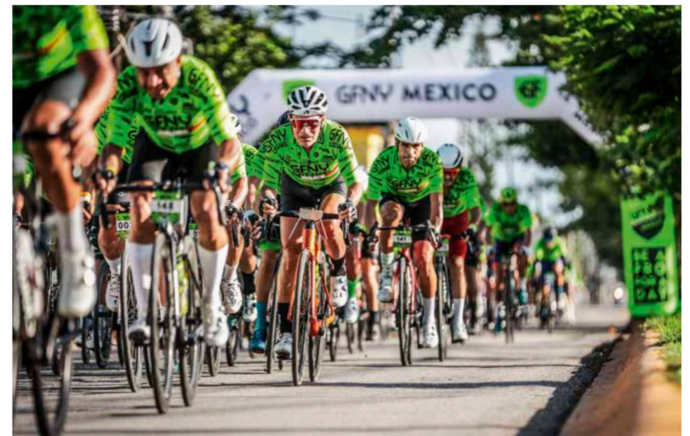
Above The lime green army awaits the starter’s horn at 7am on race day

A 19km ferry journey from the Mexican mainland takes me to the island of Cozumel, Mexico’s largest inhabited island, but one that largely consists of untouched mangrove forests and swamps. It’s a tropical haven of wildlife, white sands and coral reefs, the crystalline water producing one of the world’s great diving locations while its deep-water harbour makes it a major cruise ship destination. Cozumel is also an endurance sports paradise, with the long-established Ironman Cozumel held on the weekend following GFNY Cozumel in 2023 and triathletes already out in force on aerobars on the island’s highway.