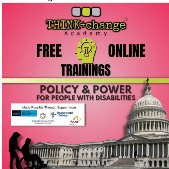
Image description: Think Change Storytelling Talks logo with Talks Trainings Tools written below it. Text reads Policy & Power for People with Disabilities. Below are graphics of a government building with two people in silhouette walking up to it, one pushing the other in a wheelchair. Made possible through support from Colorado Cross-Disability Coalition, Colorado Developmental Disabilities Council, Developmental Pathways, and The Arc of Aurora.

#Disability #ChangeMaker #Policy #PolicyTraining #Legislation #DisabilityLeaders #DisabilityVoices #NothingAboutUsWithoutUs #Government101 #StateLaws #FederalLaws #LocalLaws #Capitol #Lawmakers #DisabilityAdvocacy #DisabilityIssues #DisabilityCommunity #Olmstead #ColoradoStory #ColoradoGovernment #DisabilityRepresentation #CommunityIntegration #SpeakUp #SpeakOut #Boards #Committees #SystemChange #ThinkChange #ThinkChangeTALKS #ThinkChangeTRAINING #ThinkChangeTOOL