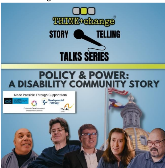
Image description: Think Change Storytelling Talks logo that includes a black microphone with a cord. Below are the five storytellers featured in this documentary, a man with short grey hair, a man with medium brown hair and glasses, a man with light brown hair and glasses, a woman with long brown hair, and a man with short black hair and glasses. Text reads Policy & Power: A Disability Community Story. Made possible through support from Colorado Cross-Disability Coalition, Colorado Developmental Disabilities Council, Developmental Pathways, and The Arc of Aurora.

#Disability #ChangeMaker #Policy #PolicyTraining #Legislation #DisabilityLeaders #DisabilityVoices #NothingAboutUsWithoutUs #Government101 #StateLaws #FederalLaws #LocalLaws #Capitol #Lawmakers #DisabilityAdvocacy #DisabilityIssues #DisabilityCommunity #Olmstead #ColoradoStory #ColoradoGovernment #DisabilityRepresentation #CommunityIntegration #SpeakUp #SpeakOut #Boards #Committees #SystemChange #ThinkChange #ThinkChangeTALKS #ThinkChangeTRAINING #ThinkChangeTOOL