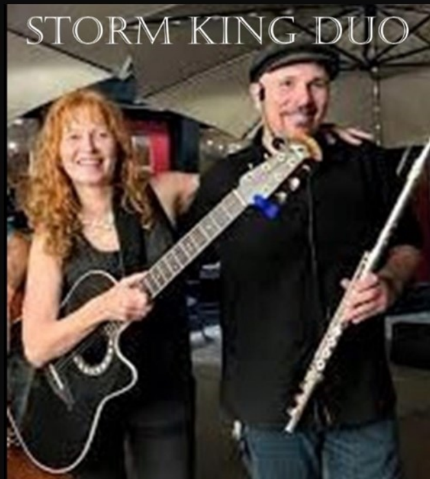
STORM KING DUO