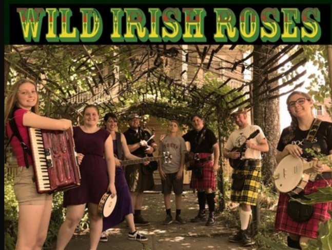
WILD IRISH ROSES