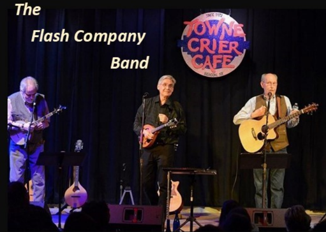
The Flash Company Band