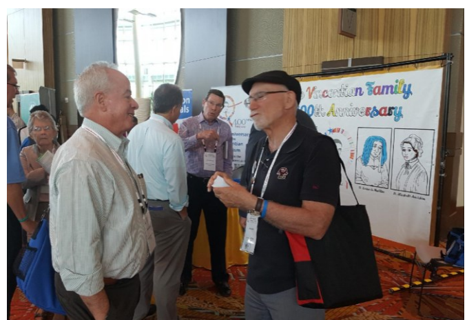
Top Left: Vincentian volunteers hand out information about the Society at the SVdP booth.