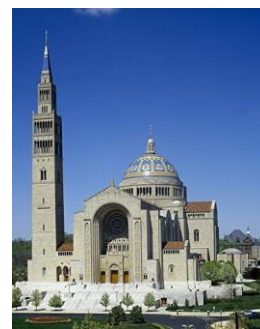
The Basilica of the National Shrine of the Immaculate Conception.