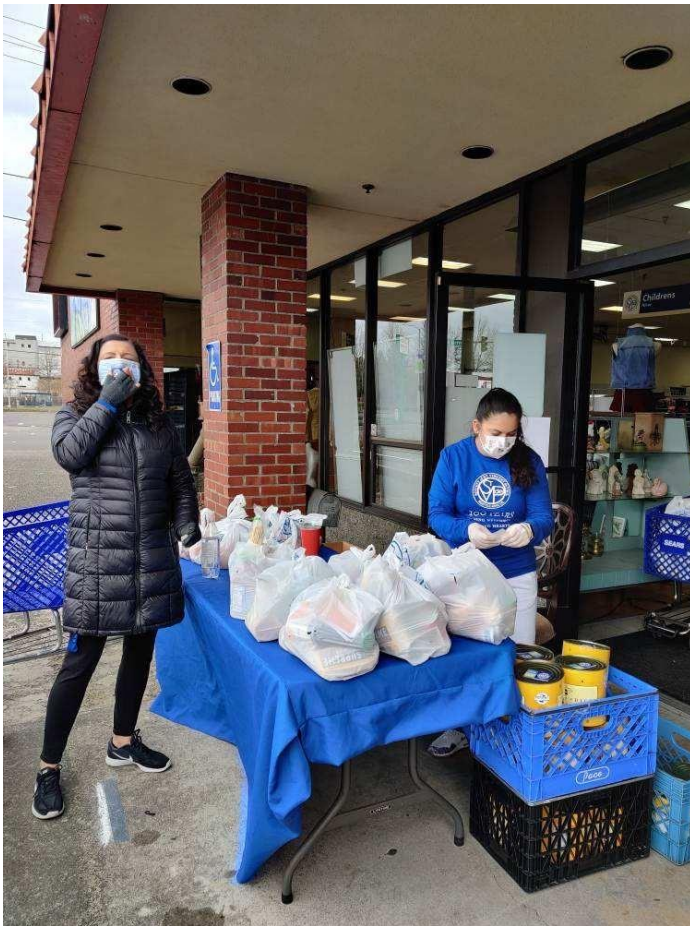
Centro Rendu staff taking social distancing options before distributing food to needy neighbors.

They have already served roughly 250 families, giving out 340 bags of pre-packaged food! There are no requirements, just a name, date of birth, number of family members and city/zip code! THANK YOU Centro Rendu for your dedication towards helping others in need! #svdpseattle #svdp #centrorendu #community #kent #thriftstore #seattle #kingcounty #givingback #helpingothers #nonprofit #foodbank #servingfamilies