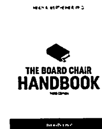
The Board Chair Handbook