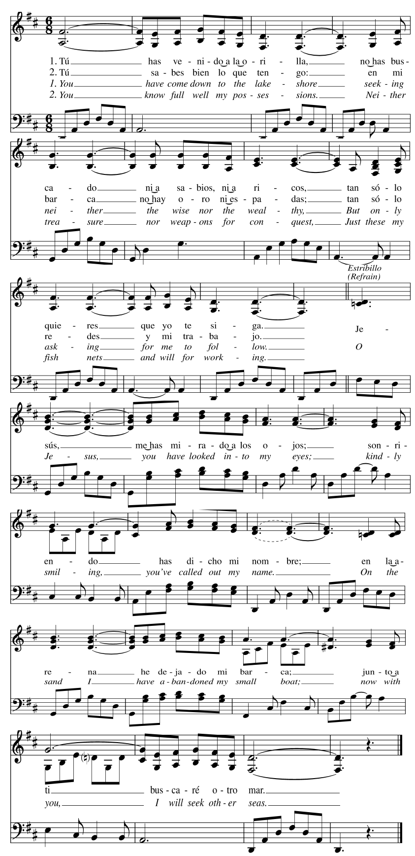
Music: harmonization Skinner Chávez-Melo, 1987, used by permission of Juan Francisco Chávez. Text and music © 1979, 1987, 1989, Cesareo Gabaraín. All rights reserved. Used with permission. Published by OCP. Reprinted with permission under ONE LICENSE #A-401793.