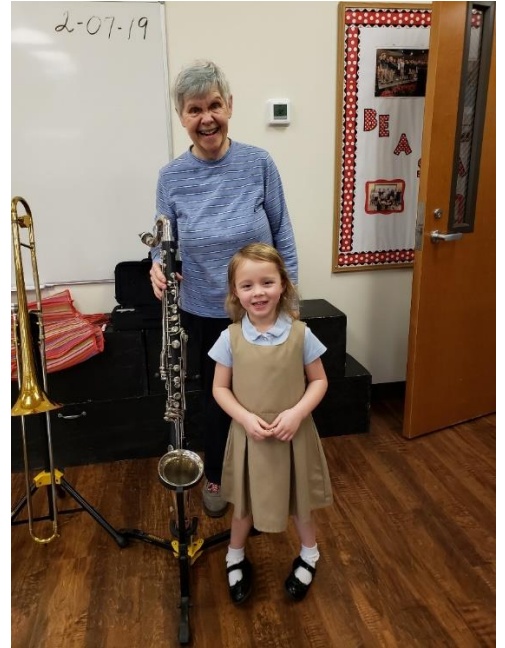
Drum Circle Co-Curricular