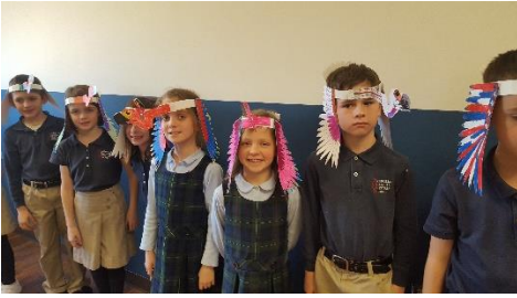
5 th Grade Science