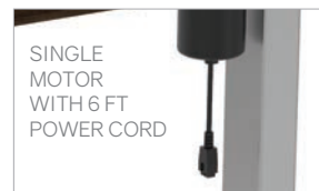
SINGLE MOTOR WITH 6 FT POWER CORD