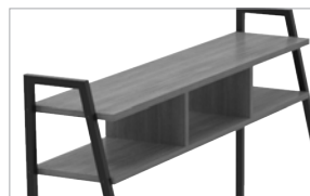
Open Shelves Plenty Of Storage Space