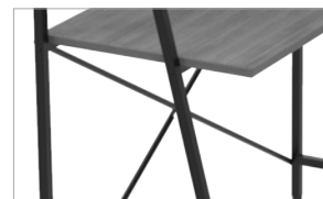
Strong & Sturdy Iron Tube Framework