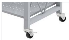
Heavy-Duty Casters Allows Easy Mobility