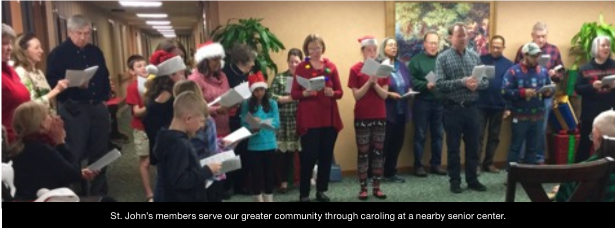
St. John's members serve our greater community through caroling at a nearby senior center.

In addition to its school districts, Naperville also has colleges and universities in proximity. North Central College is located within downtown Naperville and several other higher education institutions are nearby including Benedictine University, the College of DuPage, and Aurora University. Naperville is also the home to satellite campuses of other colleges and universities such as Northern Illinois University, Governor's State University, and Indiana Tech.