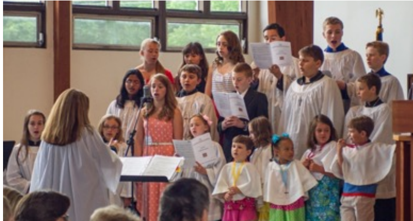
Youth participate in services in various ways.

thought-provoking messages with a wow-factor that promotes follow-up discussions”