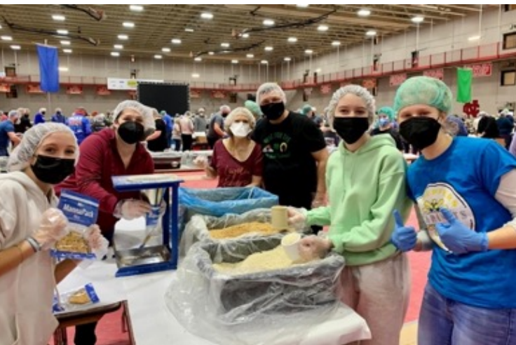
St. John's members taking part in a community-wide, food-packing service project.

As the only Episcopal Church in the immediate area, St. John's serves parishioners from Naperville, Plainfield, Oswego, West Chicago, Aurora, Warrenville, Sugar Grove, and other communities across DuPage, Kendall, Kane, and Will Counties.