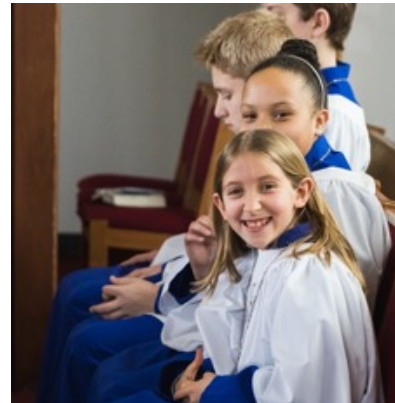
From left to right: Members of St. John's Garden Ministry, members of the Righteous Brothers Ministry who keep our parish well-fed. Acolytes range from 2nd grade through high schoolers

Our parish also supports many other ministries; these activities provide opportunities for parishioners to find an avenue for sharing their time, talents, and treasures with the community surrounding our parish.