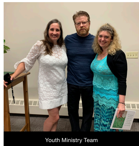
Youth Ministry Team

Treasurer Junior High Youth Ministers Senior Warden Junior Warden