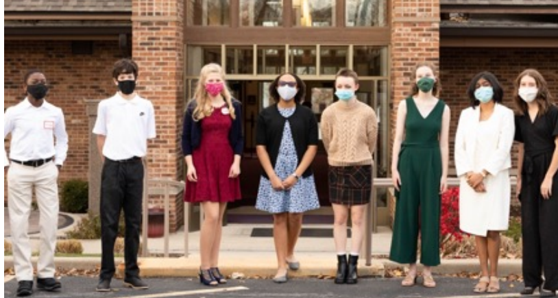
From left to right: St. John's 2022 First Communion Class and St. John's 2020 Confirmation Class.