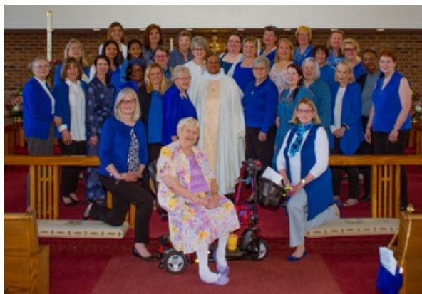
St. John's Chapter of Daughters of the King.