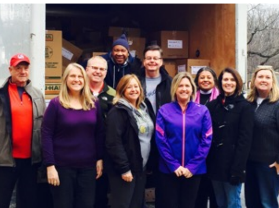
St. John's Members delivering Christmas gifts to those in need.