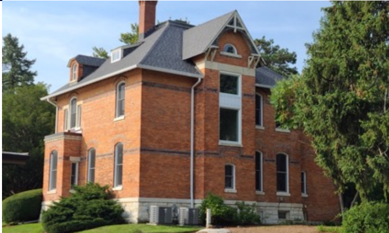
St. John's rectory sits on extensive outdoor church grounds