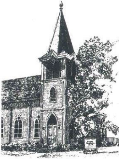
Covington Presbyterian Church