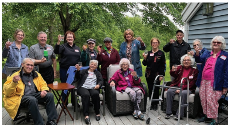
June 28th at 4 PM