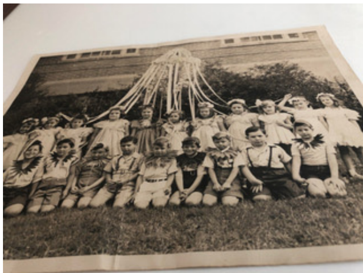
The author is seated in the front row, fourth in from the right.

Youtube 2nd Annual Survey Link: https://www.youtube.com/watch?v=49yGaoVcgs4