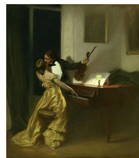
"The Kreutzer Sonata" (oil painting 1901)

Does music have inherent properties of feeling? Does it "mean" anything? Tough and provocative issues! with lots of listening, as always, and sideways glances at the other arts.