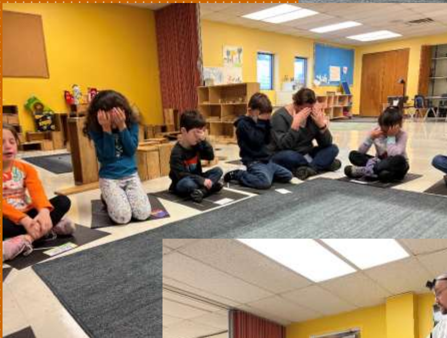
Saying the Sh'ma together