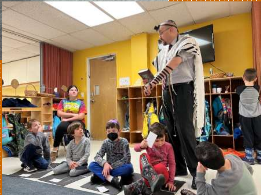
Learning about tefillin together