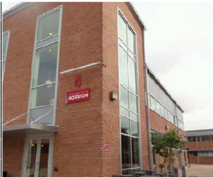
We are located in Building 4.