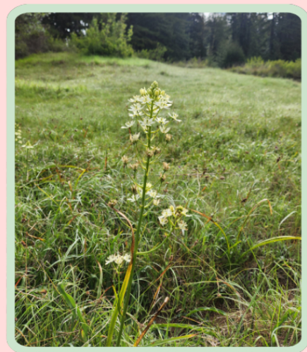
Lone Death Camas