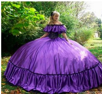
My new social distancing outfit just arrived from amazon

Home schooling Day #3: they all graduated.