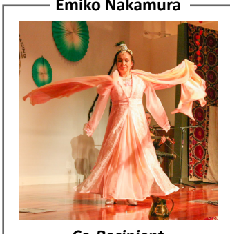
Co-Recipient Gordon Ekvall Tracie Memorial Award