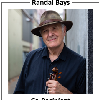
Co-Recipient Gordon Ekvall Tracie Memorial Award