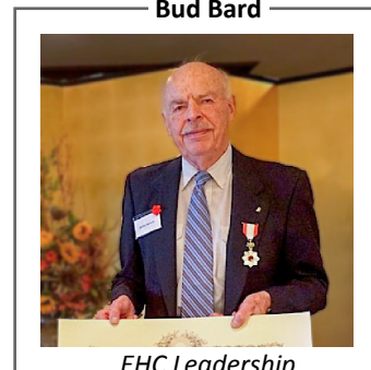
EHC Leadership & Service Award