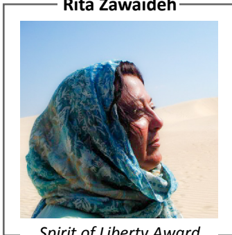
Spirit of Liberty Award