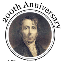
of Channing's sermon "Unitarian Christianity"