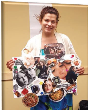
Share Your Favorite Things!

People Planning Together (also called PPT) is a training for people with intellectual disabilities to have more positive control over their lives. People spend time identifying the meaningful things in their lives and building it into a plan that can be shared with others.