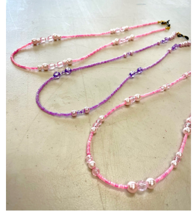
自製玻璃珠鍊工作坊 by Shirley Yang