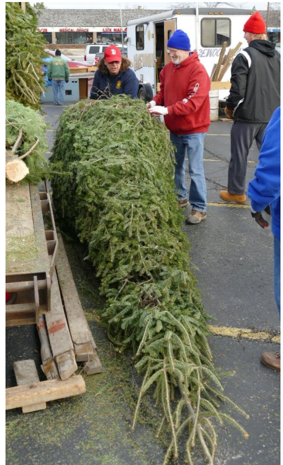
The "BIG ONE"