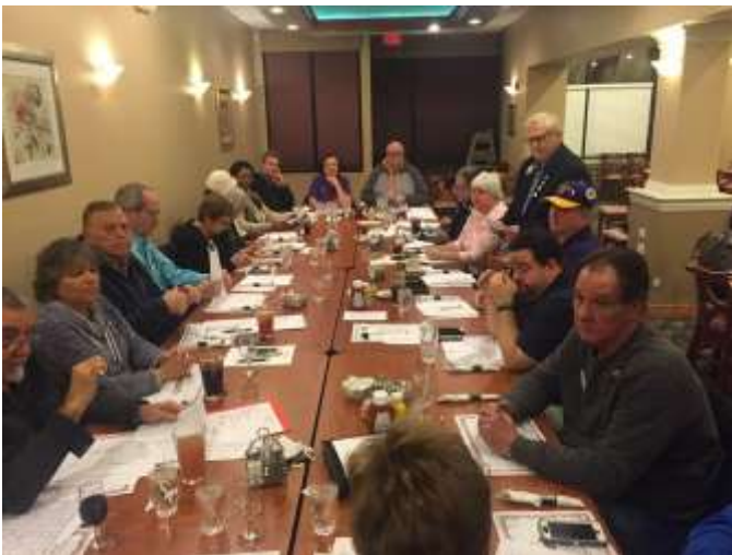
District 1A held their GAT meeting at Connie's Family Pizzeria in Berwyn.