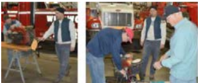
Lions changing the oil on lawn mowers.