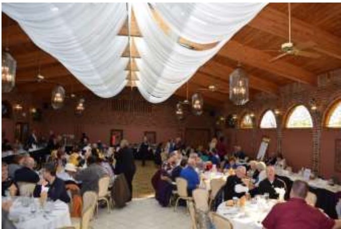
Partial crowd at District 1A Mid Year Leadership Forum. There were several exhibits – GLT, GMT, GST, LCIF, LIF, Leader Dog, VOICES, District Convention, Golf Outing, Bowling, Hellen Keller 5K Run and Walk, etc., etc.