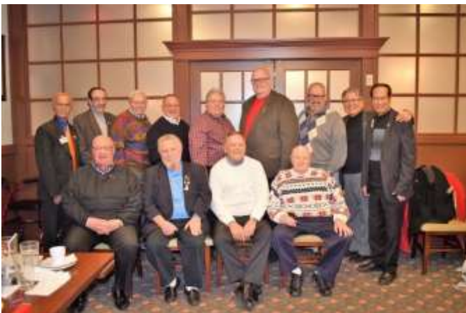
District 1A Past District Governors' Club members at one of their meetings at Stevans Restaurant, Burr Ridge on January 28 th .