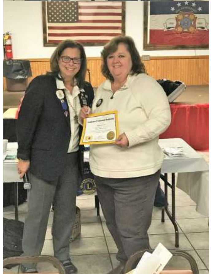
Dixon Lionesses join Lions Club.