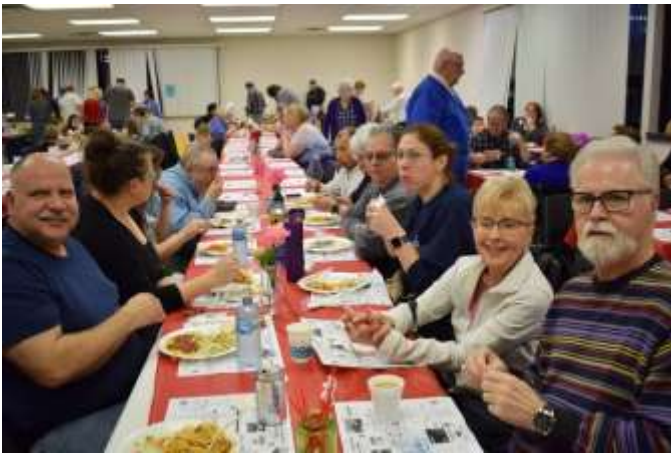
One happy crowd enjoying spaghetti dinner by Stickney Forest View Lions.