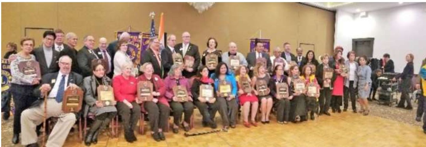
Melvin Jones Fellows who joined to celebrate Lions Founder Melvin Jones's 139 th Birthday Party which held at the Chicago Four Points Sheraton at O'Hare on January 14 th .