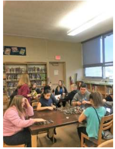
Rockford Flinn Leo Club sorting sorting eyeglasses as their service project. 1,010 pairs of eyeglasses were sorted in just 20 minutes! Way to go Leos!!