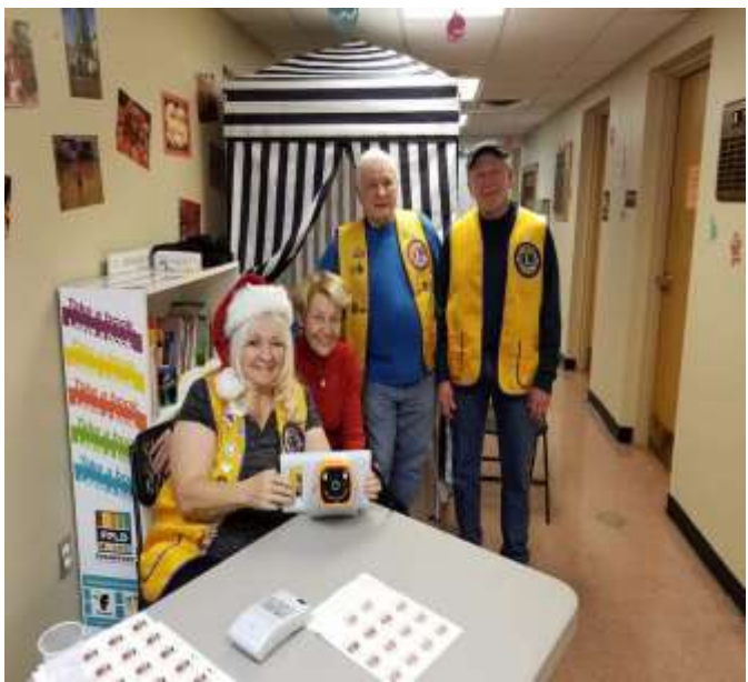
Frankfort Lions conducted children's vision screening at a family holiday event sponsored by the Frankfort Recreation Center

The Mokena Lions find great ways to make their new members feel welcomed. At their December meeting, we were treated to the "12 Days of a Mokena Christmas" sung by the newest members of the Club. The "12 days" bragged on the great works