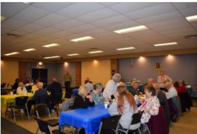
Schiller Park Lions held their Annual Spaghetti Dinner Fund Raiser at Schiller Park Community Hall.