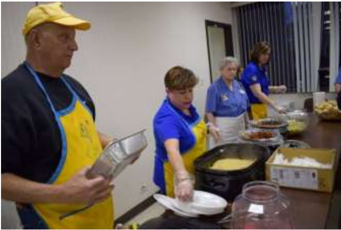
Stickney Forest View Lions Club volunteers for their Annual Spaghetti Dinner.