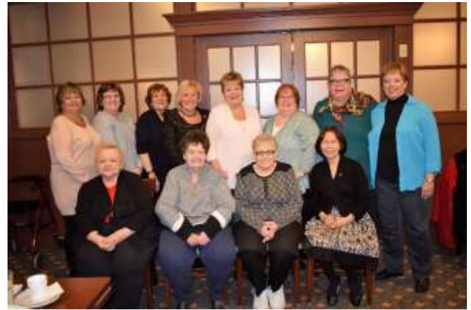
District 1A First ladies posing after their dinner.