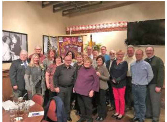
Group photograph of members after Orland Park Lions installation of 2 new members.