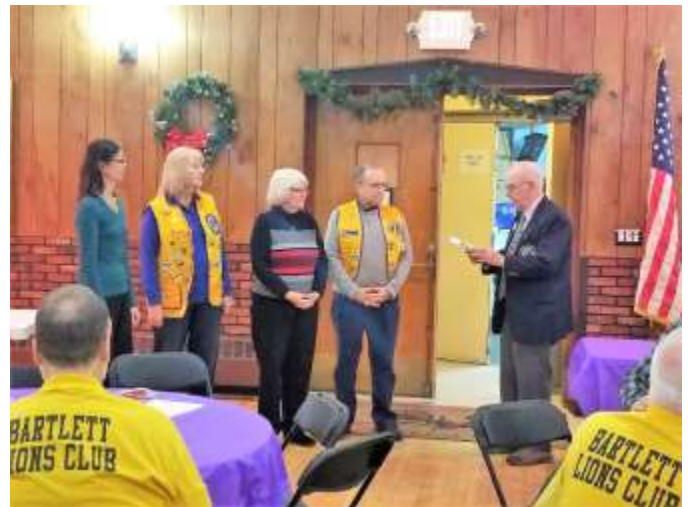
The Bartlett Lions Club welcomed two new members on January 24, 2018.