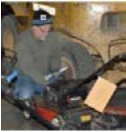
Changing the oil