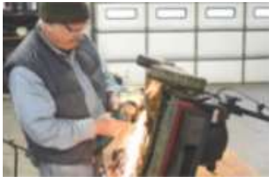
Sharpening the blades