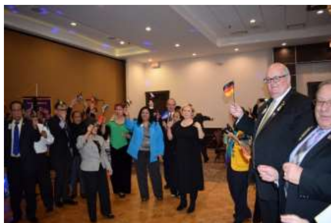
Parade of Intl. flags to promise Lions Service