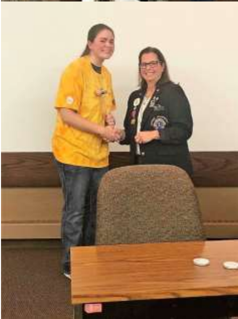
Rockford Noon Lions Sponsor The Parkview Pride Leo Club