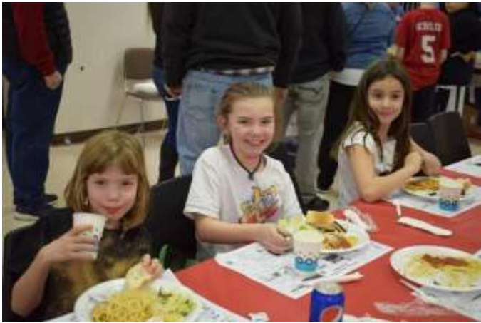
Tiny Tots enjoying Spaghetti Dinner in Stickney.