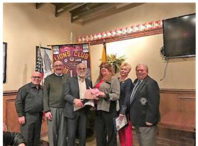
Orland Park Lions Club honored all the local school nurses and Lenscrafters for their help in our community!