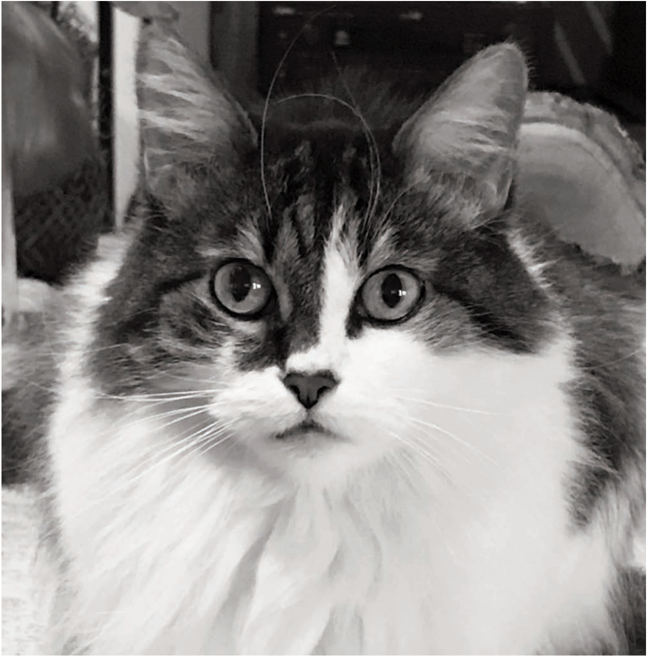
Grey Scale Photo Reference