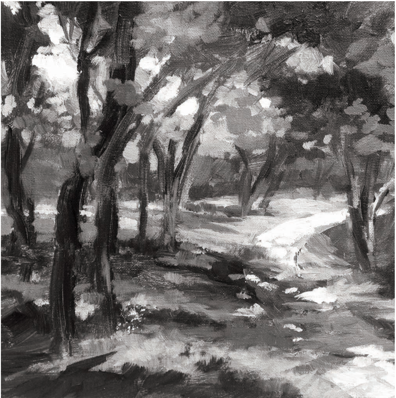
In the Tuscan Shade - Grey Scale