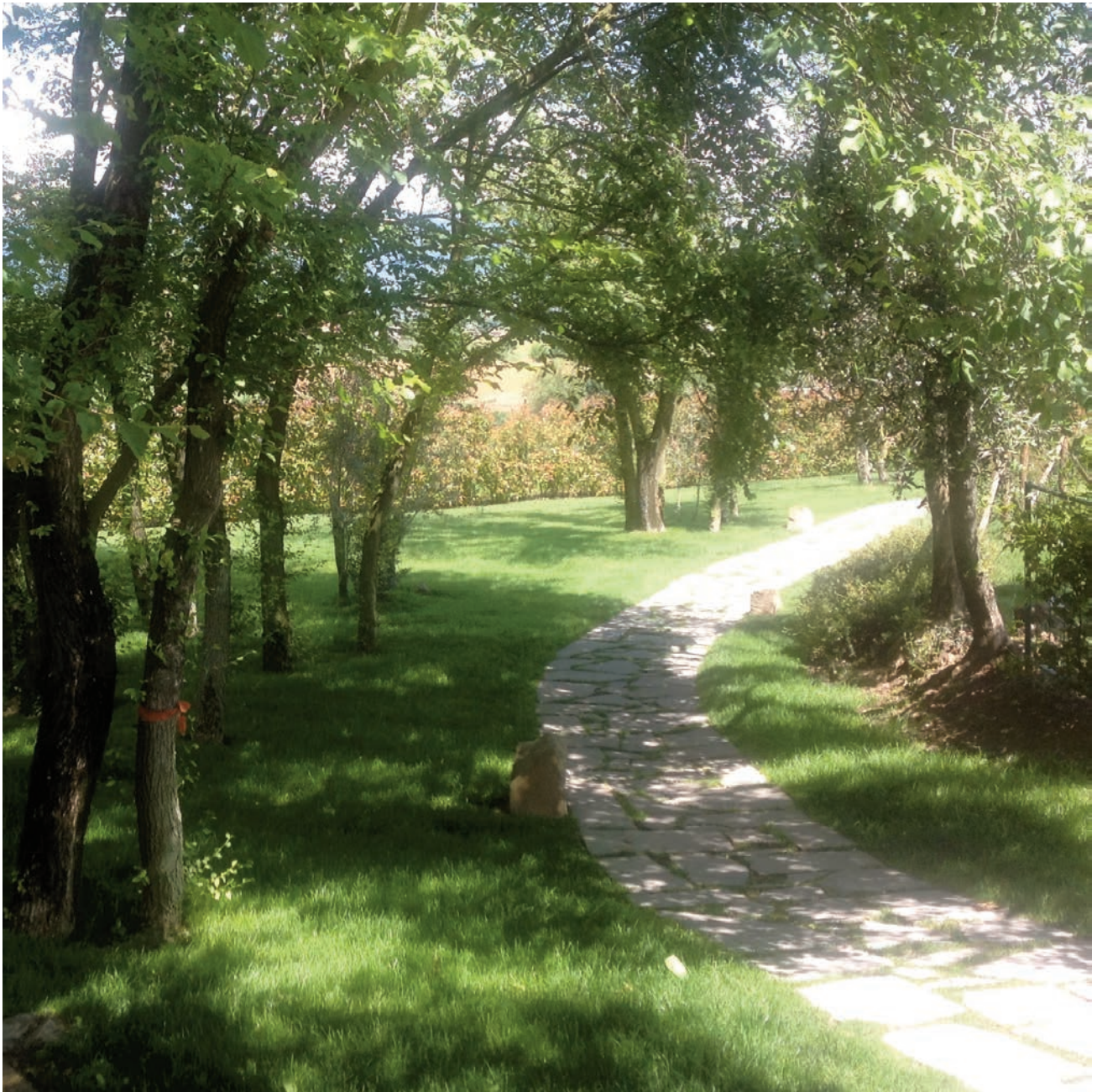
In the Tuscan Shade - Photo