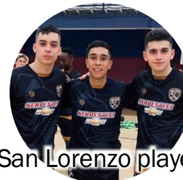
3 San Lorenzo players