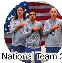
US National Team 2021