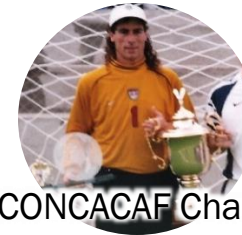
1996 CONCACAF Champions