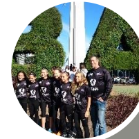
Ohio North Futsal – Buenos Aires 2017