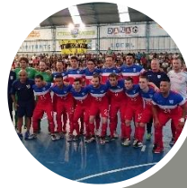
US Futsal National Team – Buenos Aires 2016

We also organized the friendly game in Denver, Colorado, between Colorado Rapids vs Boca Jrs in July 2018