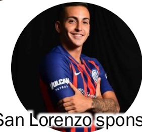
San Lorenzo sponsor