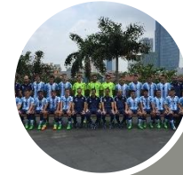
Argentina National Team U20 – Vietnam 2017