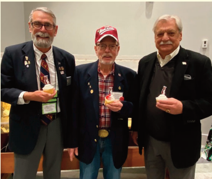
1st Place Golf Team