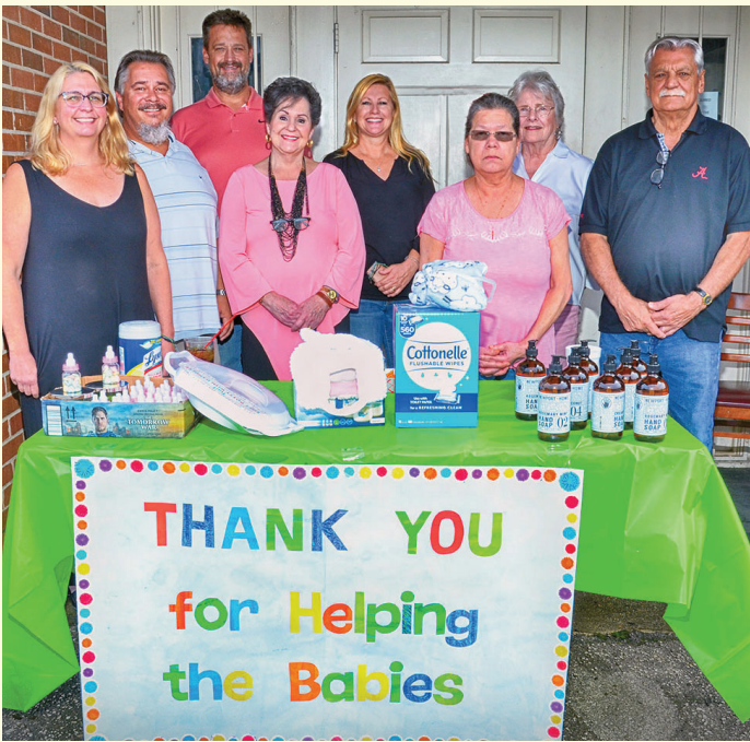
Thank you to all the volunteers for the Drive Thru Baby Shower. It was a great success!