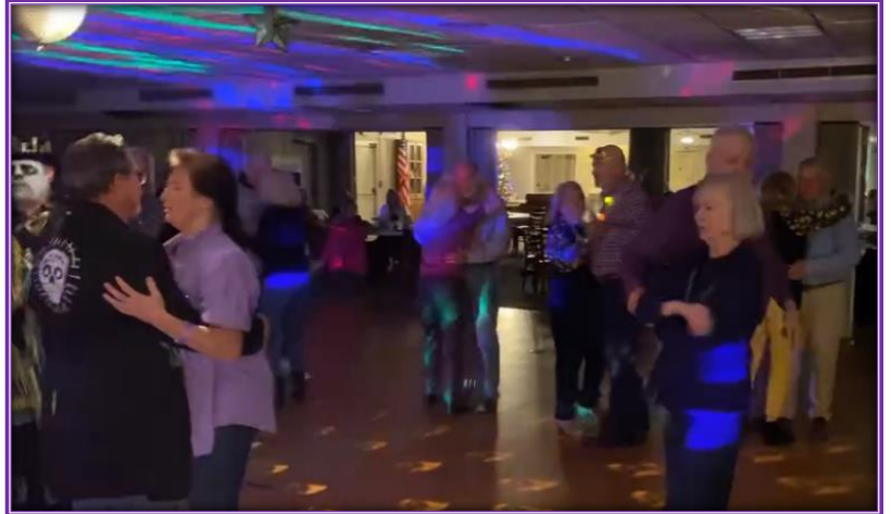
Click above for a short video. Some of our Elks know the "Sweetheart Shuffle"