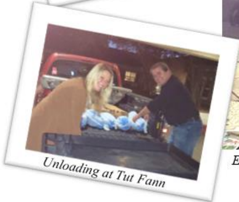
Unloading at Tut Fann