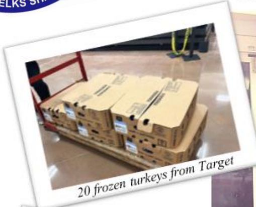
20 frozen turkeys from Target

BPOE Lodge #1648 provided 20 frozen turkeys to feed all the Tut Fann Veteran residents for their Thanksgiving Dinner. Lots of Snacks were also delivered.