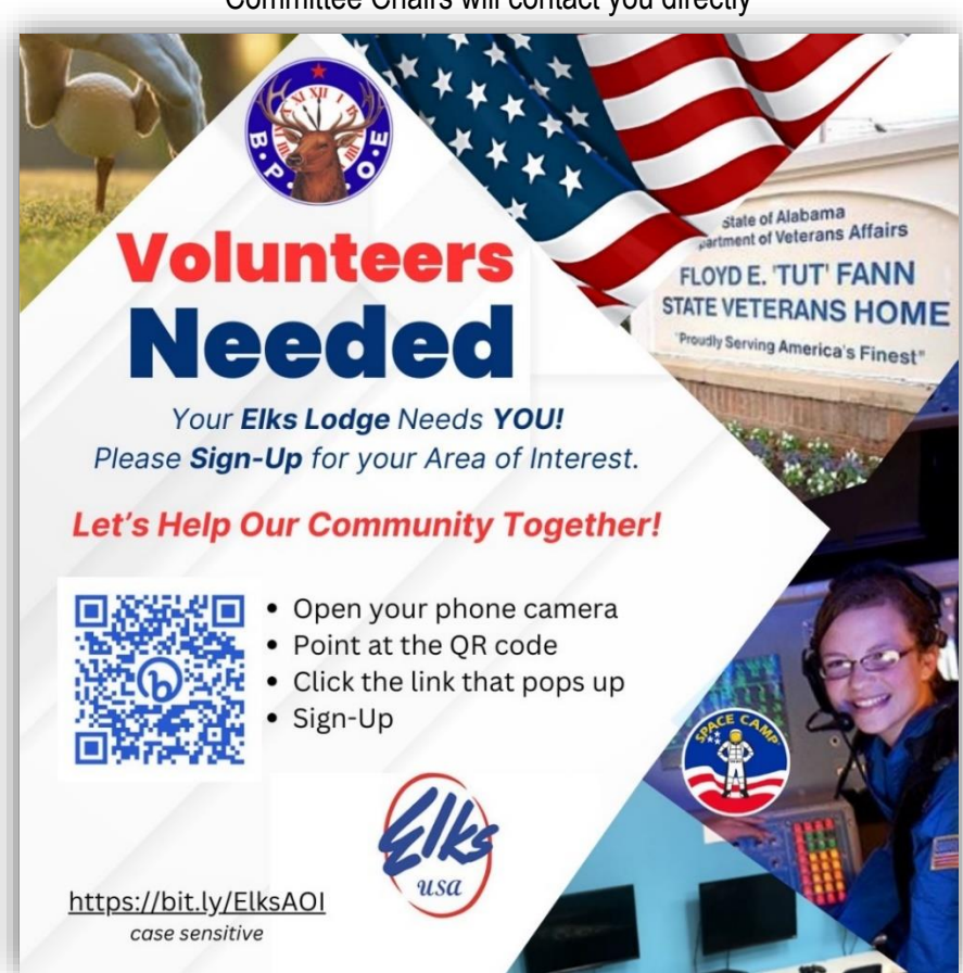
This Sign-Up is also posted in the Lodge. Click <u>HERE</u> or above to Sign-Up

Committee Chairs will contact you directly