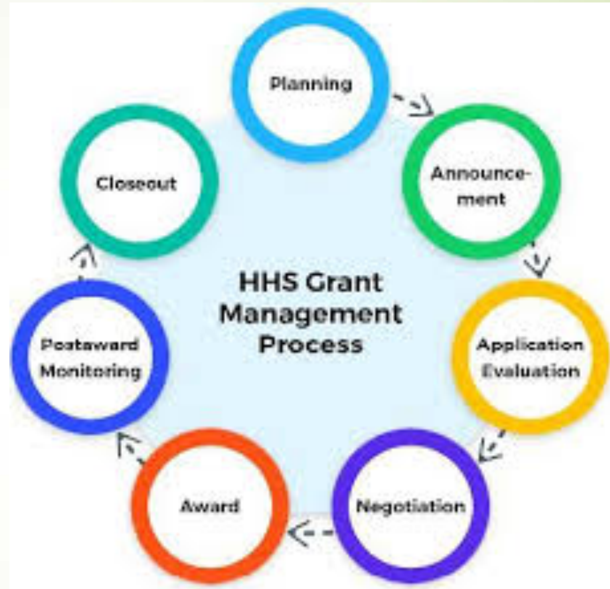
Photo Credit: U.S. Department of Health and Human Services Division of Grants, February 2009