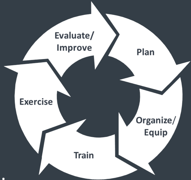
Federal Emergency Management Agency Preparedness Cycle

...the capabilities support the full preparedness cycle.