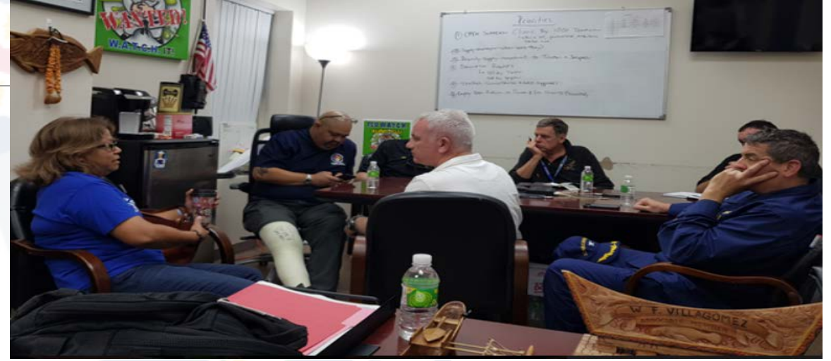
Meeting with Region IX – CEO/IC