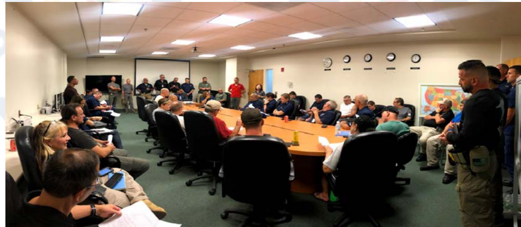
Briefing with our Partners in the Field