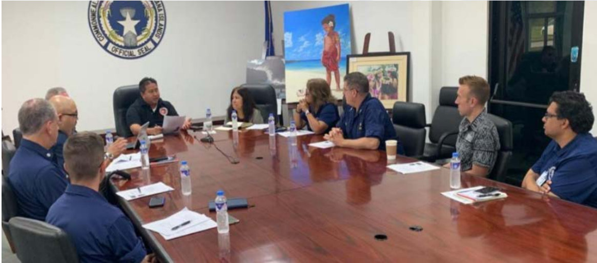
Information Sharing – CNMI Gov. (Multidisciplinary sharing of information and providing situational awareness)