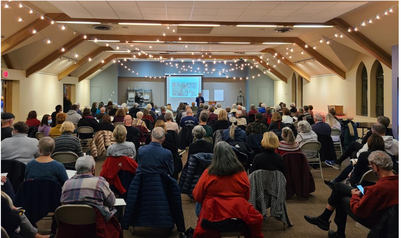
Good Faith Network Problems Assembly at St. Michael's, December 7, 2021

St. Michael and All Angels Episcopal Church