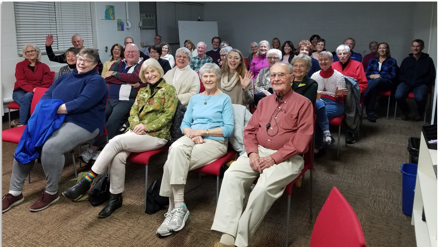
Over 40 parishioners gathered to watch the documentary, I Am Not Your Negro , on November 20.