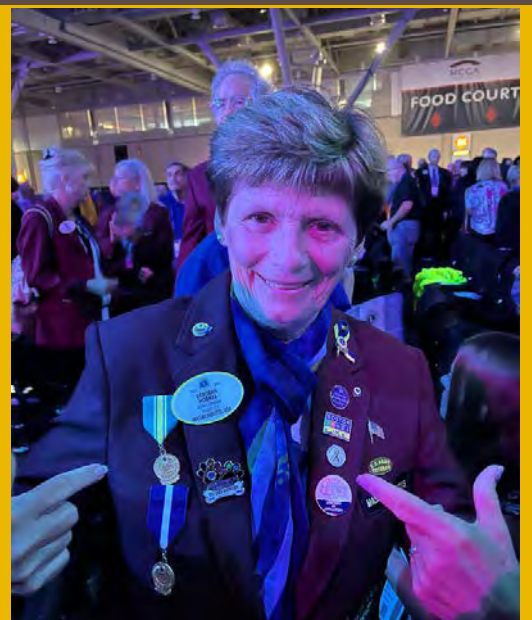
... TO THE FINAL MOMENT...