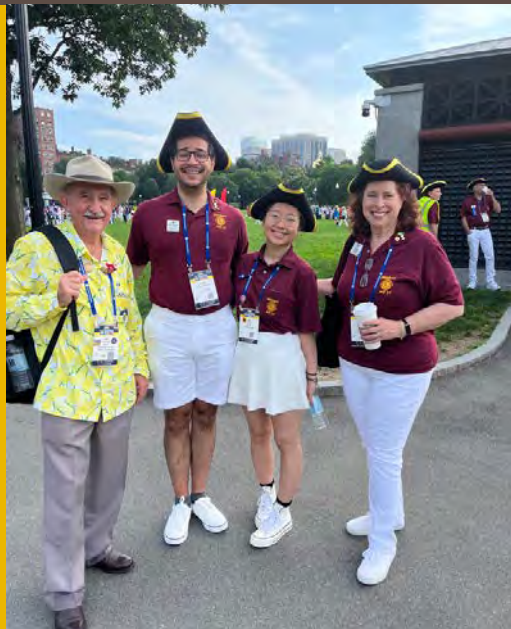
... TO THE PARADE...