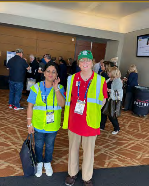
FROM THE CLASSROOMS...