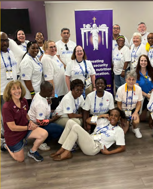
FROM THE SERVICE PROJECTS...