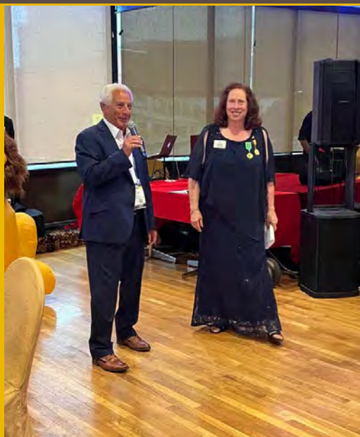
... TO THE CAUCUS...