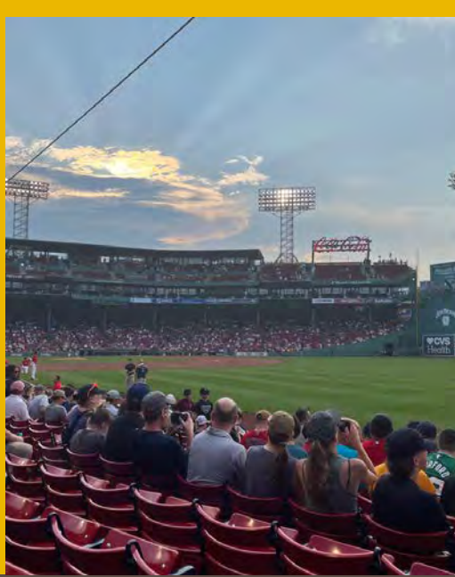
... TO FENWAY...