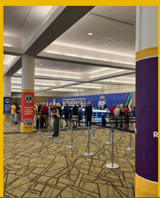
... TO THE BCEC...