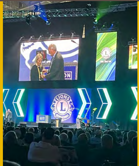
... TO THE PLENARY SESSIONS...