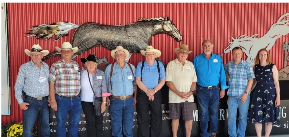
MRAS Presidents reunited at the legacy mural unveiling, August 2021