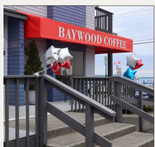
Baywood/ Bay Center