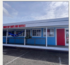
Carts + Rental