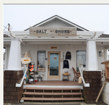
Salt + Shore