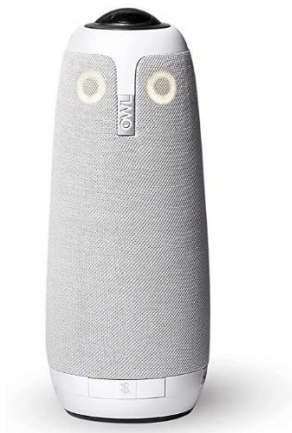
Meeting Owl Pro—All-in-one Audio Video 360 Degree Conference Device