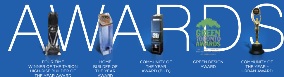
FOUR-TIME WINNER OF THE TARON HIGH-RISE BUILDER OF THE YEAR AWARD

healthy, sustainable communities. Daniels also partnered with renowned filmmaker Ivan Reitman to build TIFF Bell Lightbox, an international destination for the world of film. In addition to the iconic home of the Toronto International Film Festival, this mixed-use development includes restaurants, ground floor retail, a commercial parking garage and the 44-storey Festival Tower Residence. Daniels has also created iconic neighbourhoods throughout the GTA, providing residential, retail and commercial services within their Daniels Waterfront - City of the Arts, NY Towers and HighPark Condominium communities in Toronto, as well as Daniels City Centre and Daniels Erin Mills communities in Mississauga.