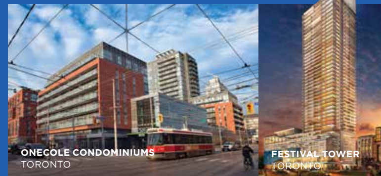
ONECOLE CONDOMINIUMS TORONTO

Dedicated to upholding a "people-first" philosophy, Daniels has long been a champion of affordable rental and ownership housing, and has built 3,600 affordable rental-housing units under several government programs. Daniels was the first developer to offer purpose-built rental housing in the Greater Toronto Area in 25 years through its Gateway Rental portfolio. In partnership with Sun Life Financial, Daniels has built a market rental building as part of its Daniels Erin Mills community in Mississauga. Daniels FirstHome™ communities across the GTA provide quality-built residences priced within the reach of first-time buyers, and at selected communities, Daniels is building seniors housing with Amica Mature Lifestyles Inc. On the commercial end of the spectrum, Daniels creates outstanding business opportunities for national brand companies as well as grassroots not-for-profit organizations. Over the past 35 years, Daniels has embraced financial and hands-on generosity toward a number of charities and non-profit organizations, including Second Harvest, Eva's Initiatives, Habitat for Humanity, and Covenant House Toronto.