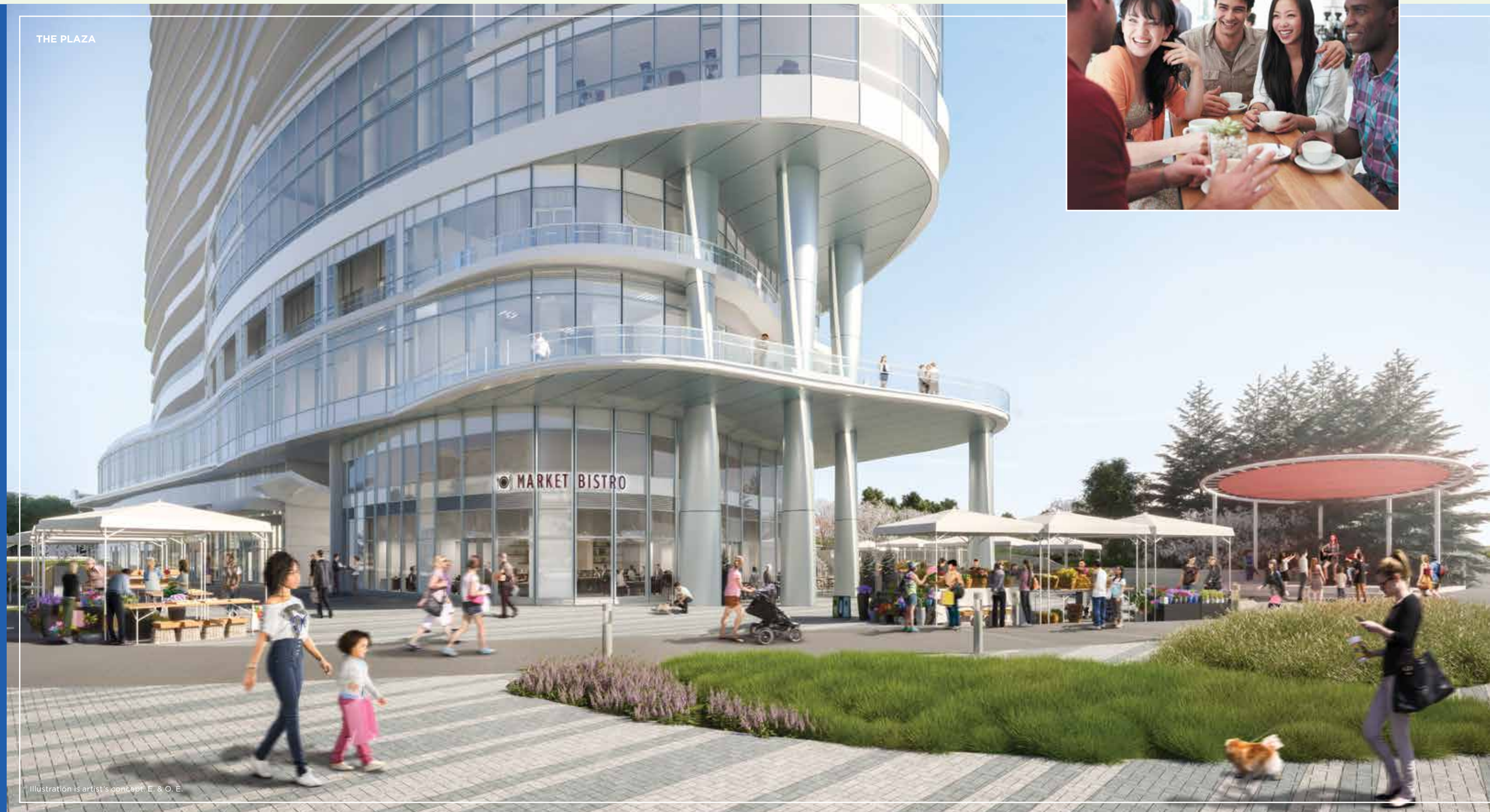
Illustration is artist's concept. E. & O. E.