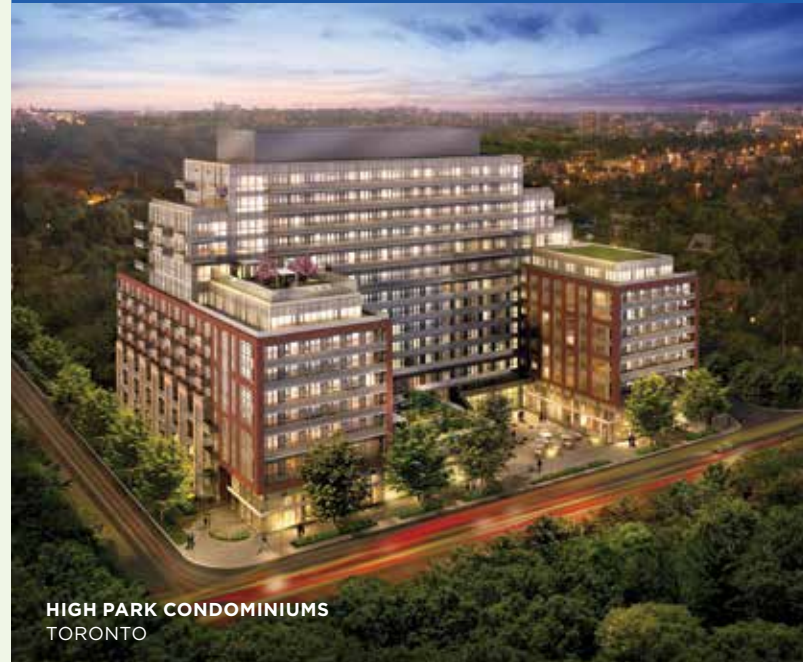
HIGH PARK CONDOMINIUMS TORONTO