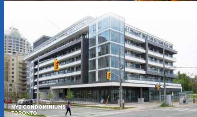
NY2 CONDOMINIUMS TORONTO