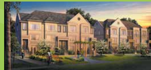
DANIELS FIRSTHOME™ COMMUNITIES THROUGHOUT THE GTA TORONTO