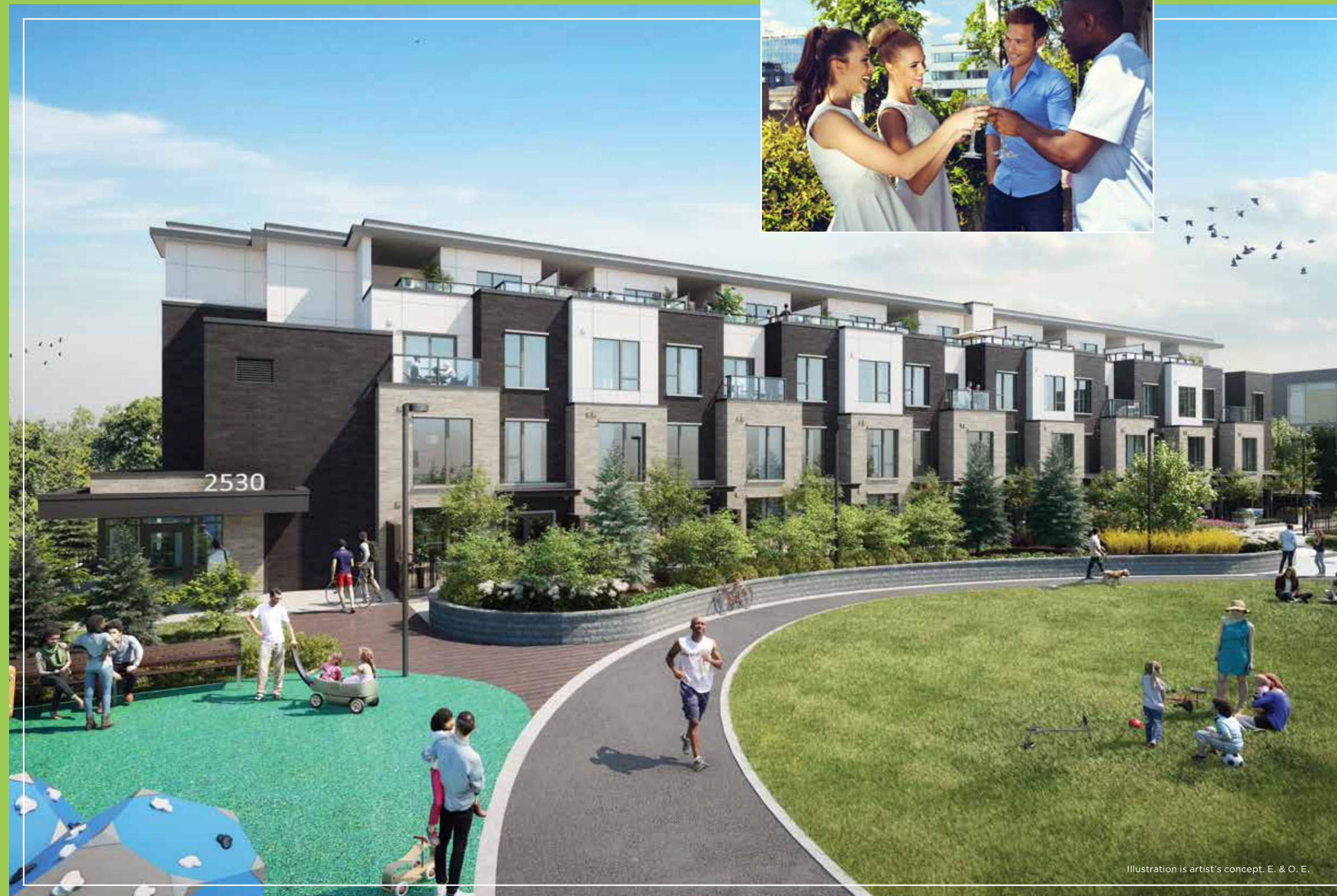
Illustration is artist's concept. E. & O. E.

Parc Towns are uniquely designed to spotlight gorgeous, private outdoor spaces on multiple levels of your home, inviting the beauty of nature into your life. On the ground floor, relish in the expansive space of your living room, then walk out onto a lovely natural patio for a breath of fresh air. Take the pleasure up a level to your personal rooftop terrace and enjoy an exclusive outdoor oasis with ample space to enjoy an alfresco dinner with the entire family under the stars.