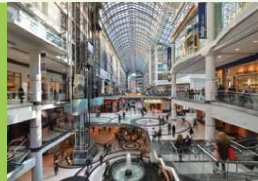
TORONTO EATON CENTRE TORONTO