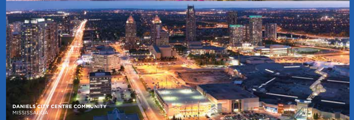
DANIELS CITY CENTRE COMMUNITY MISSISSAUGA