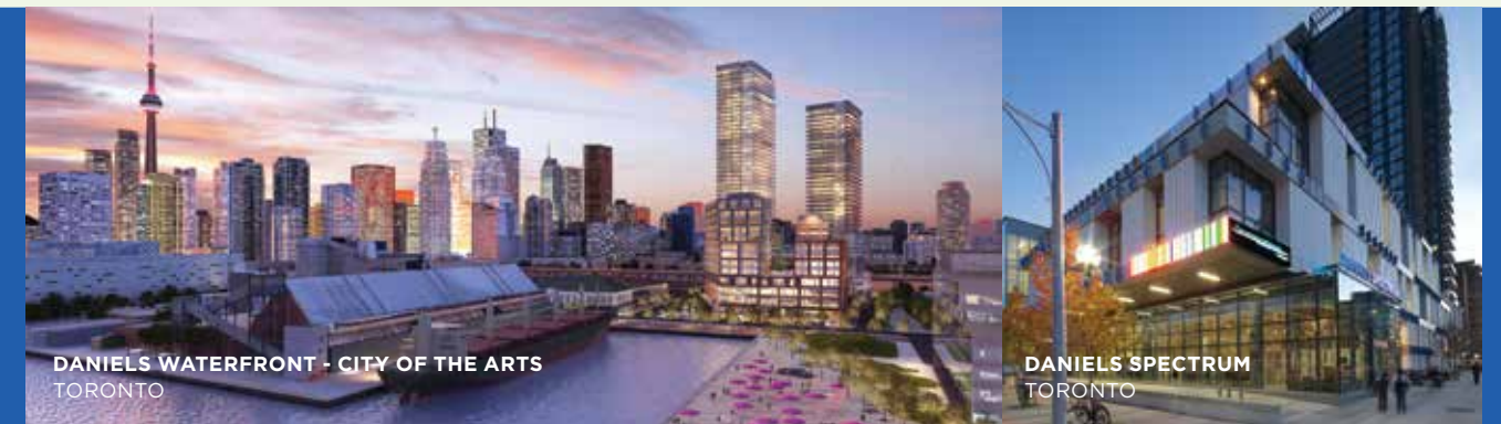
DANIELS WATERFRONT - CITY OF THE ARTS TORONTO