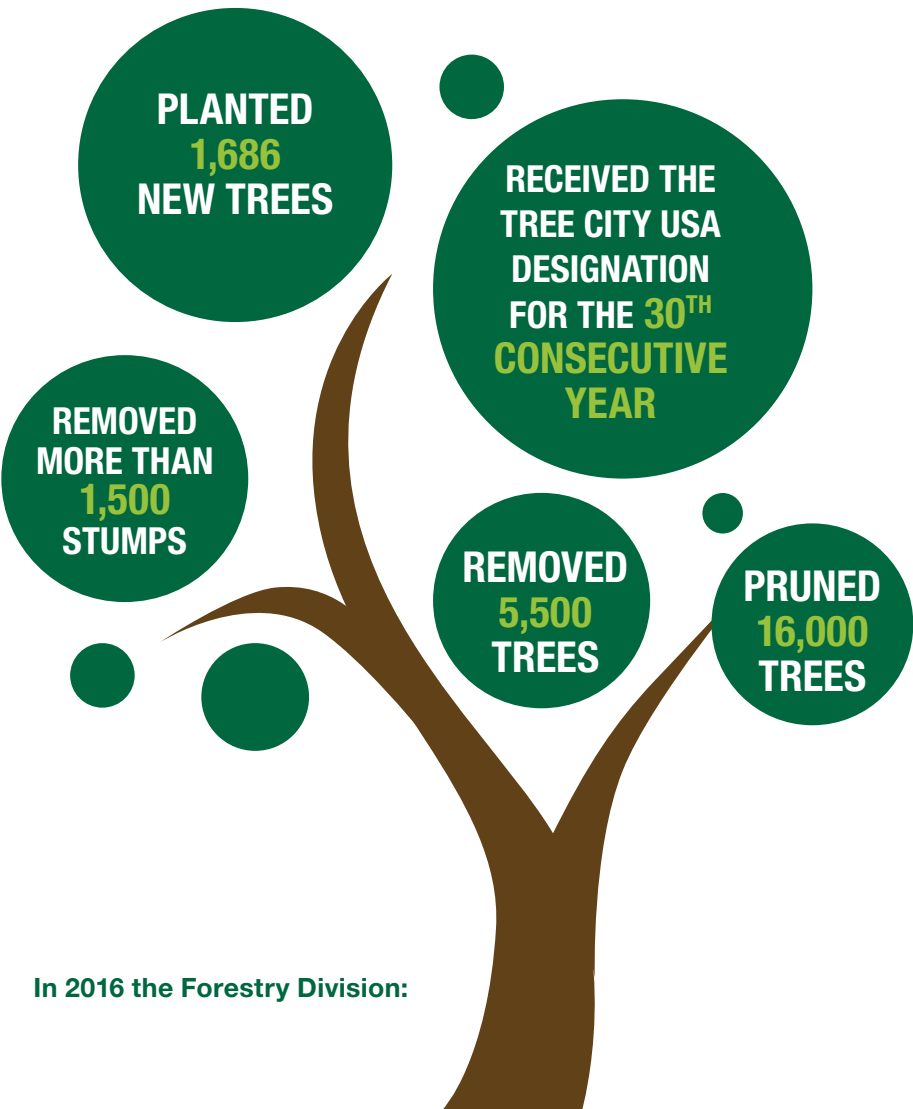
In 2016 the Forestry Division: