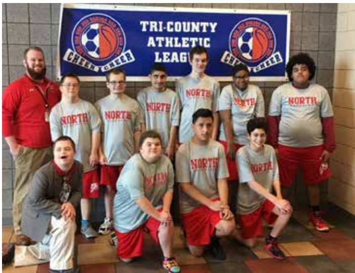
Redskin pride- Wichita North's Applied Academics team was thrilled to win the city championship in basketball this year. Team members were also thrilled to receive brand-new uniforms from the alumni association.

The North Alumni's major fundraiser, the 6th annual Redskin Roundup, is set for 6-11 p.m. Sat. June 24 at Indian Hills Swim Club. To see event updates, photos or to donate, go to FriendsOfWichitaNorthHigh on Facebook.